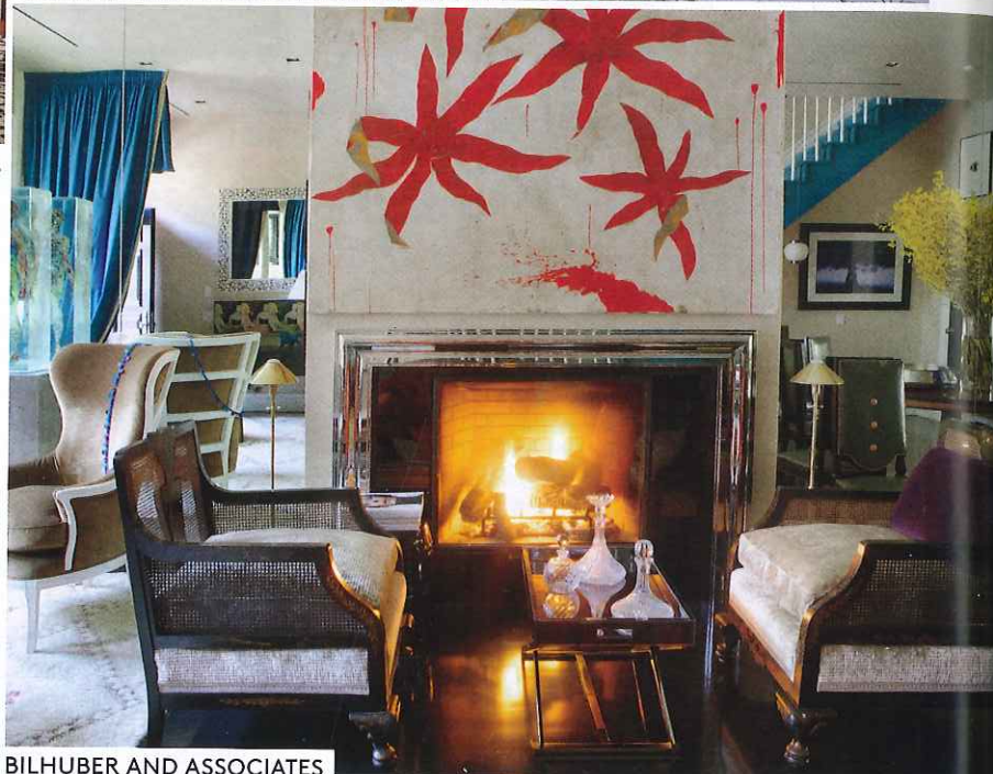
BILHUBER AND ASSOCIATES