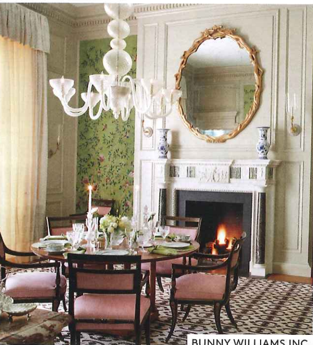
BUNNY WILLIAMS INC.